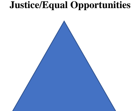
Figure 1 – Virtuous Triangle of Gender Equality

Synthetically, a virtuous triangle on the expansion of gender equality can be envisaged ( Figure 1 ). All factors – justice and equal opportunities, freedom and human rights, human development and the expansion of capabilities – are key ones for the promotion of gender equality at the national and global levels.